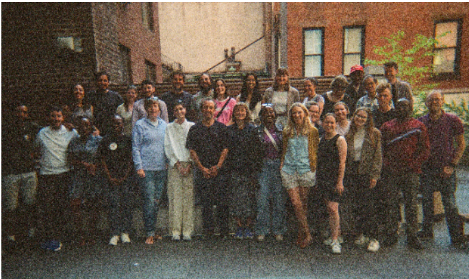
Ahead of the first session of negotiations for the UN Tax Convention - New York, August 2025

The process of negotiating a UN tax treaty was made possible in large part thanks to more than a decade of continuous engagement with civil society and the Global South . Carried out at the global level by the Global Alliance for Tax Justice (GATJ), its regional networks and its member organizations – including CCFD – Terre Solidaire – this mobilization has made it possible to keep alive the demand for a universal, inclusive and democratic multilateral tax forum, where existing frameworks had failed . Through its analyses, campaigns and advocacy, civil society has contributed to the emergence of a credible alternative to the OECD framework and to preparing the political and technical ground for the UN process. It has thus played a structuring role in the recognition, by States, of the need for a systemic reform of international tax governance.