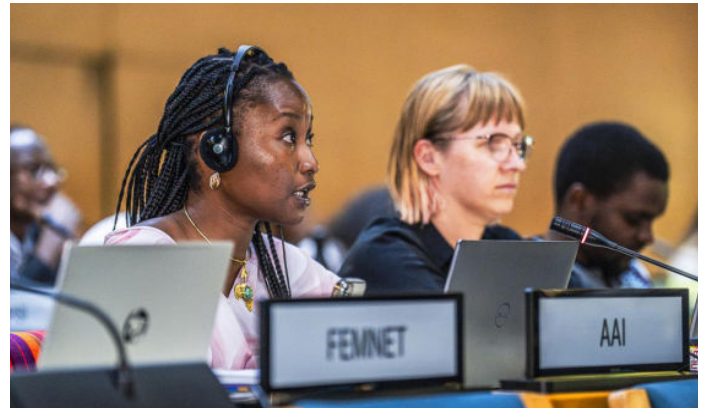
Civil society plays a decisive role during negotiations - Nairobi, November 2025