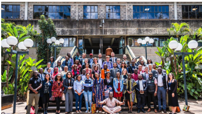
Civil society organizations at Nairobi UN headquarters for the third round of negotiations on the UN Tax Convention – Nairobi, November 2025

Presented as a “minimum basis”, the draft text immediately raised serious concerns. The central elements of the mandate – fair allocation of taxing rights, taxation of the ultra-rich, tax transparency, the fight against illicit financial flows, the links with climate and sustainable development – appeared in a very limited way. For many delegations from the South, this text raised the risk of an “empty” Convention, reduced to a declaratory framework and postponing most of the commitments to uncertain future protocols. Civil society has shared this warning: such an architecture would reproduce the fragmented and optional logics that led to the failure of the reforms led by the OECD.