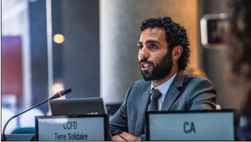
As a civil society organization, CCFD-Terre Solidaire participates in negotiations for the Tax Convention - Nairobi, November 2025